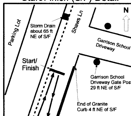
Start/Finish (S/F) Detail

Mile 3: On north side of Garrison Rd 6 ft W of UP (PSNH24 5) on same side.